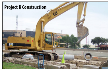
Learn the latest on what's building at the IH 610/US 290 interchange. www.my290.com